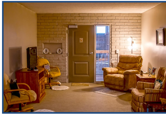
Our open floor plan allows ample space for full size living room furniture so you can move in with your favorite recliner and sofa.