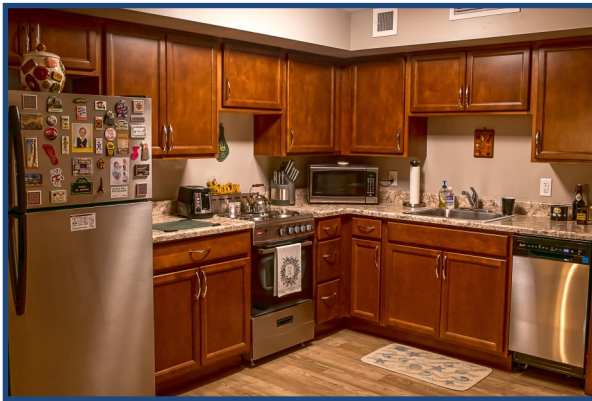
Kitchen includes beautiful countertops and ample cupboard space for storage, all appliances are supplied, including a microwave.