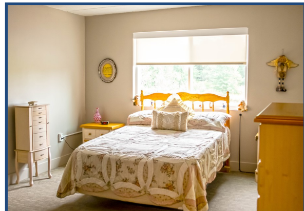
Spacious bedroom accommodates any size bed, including a king. Large sliding window allows for a healthy amount of natural light. Light filtering window shades provide light and the option of privacy when needed.