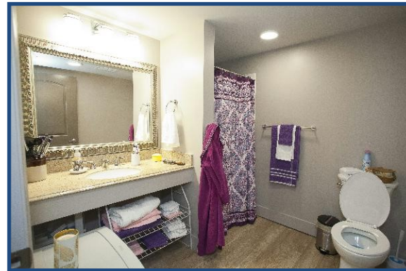
Bathrooms feature modern fixtures and granite counter tops with plenty of counter space. Walk-in showers are low threshold for easy entry. Our accessible units include barrier free showers with built-in shower seats , grab bars and a hand-held shower head for convenient use.