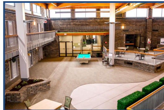
Entrances into all apartments are from the central atrium area for a safe and quiet living space with a friendly neighborhood feel. Clerestory windows in the atrium area allow abundant natural light creating a bright and beautiful space in all seasons.